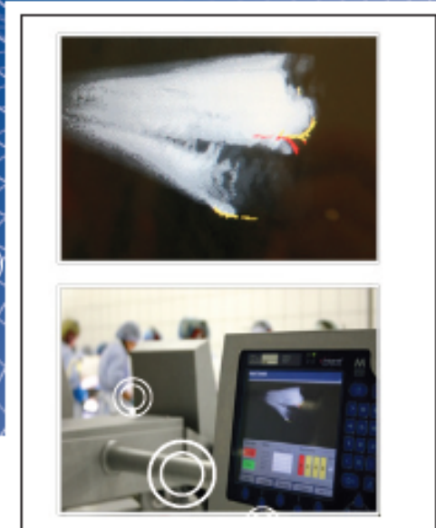
A terminal at a fish processing line, showing a fish fillet X-ray image for quality inspection

The objective of this project is to develop and test equipment to automatically cut the pinbones out of whitefish fillets, such as cod.